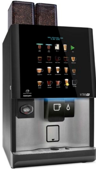
Cashless system integration option

For a self-contained operation, the Vitro X5 allows you to integrate a cashless system.