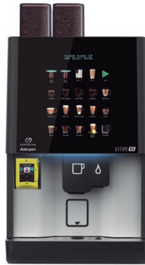
Cashless system integration option