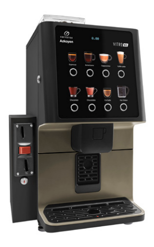
Validator module kit Ready to install a coin validator.

Vitro S1 is the perfect solution for convenience stores, service stations, hotels and restaurants where service needs to be intuitive and fast, with a daily consumption of up to 80 cups. It is also the perfect solution to promote a cooperative culture in offices of up to 40 employees, offering high quality fresh milk-based coffee beverages and a premium user experience.