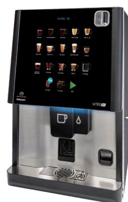
External MDB payment module