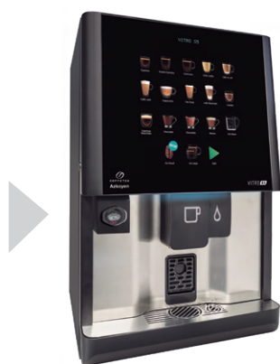
MDB cashless system integration kit

For stand-alone operation, the Vitro S5 MIA allows the inclusion of a cashless system or a separate change giver pod. In addition, it is compatible with the Pay4Vend application that allows payment to be made directly from a mobile phone.