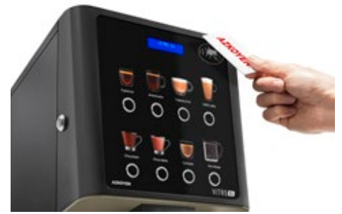
RFID Reader Kit For product recharge card or cashless systems