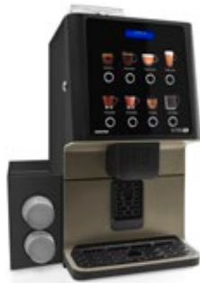
Cup module kit For dispensing cups.