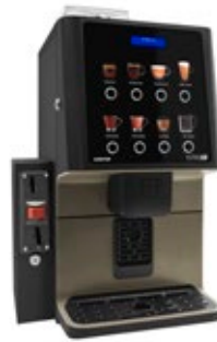
Validator module kit Ready to install a coin validator.